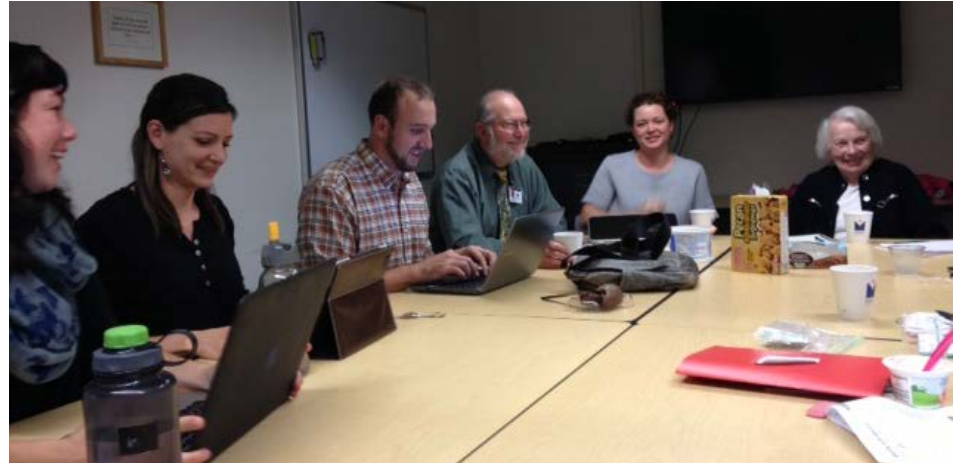
OPA Public Education Committee (PEC) members at their October committee meeting.

standing up for leadership positions because I want to make sure that people understand the value in what we do. I started owning my narrative and the narrative of the field I hold so dear. I hope that many of you will join me in voicing our opinions and using the collective power in OPA and APA to communicate our value and assure that our place in the system is commensurate with the true status of our knowledge and contribution. We're worth it.